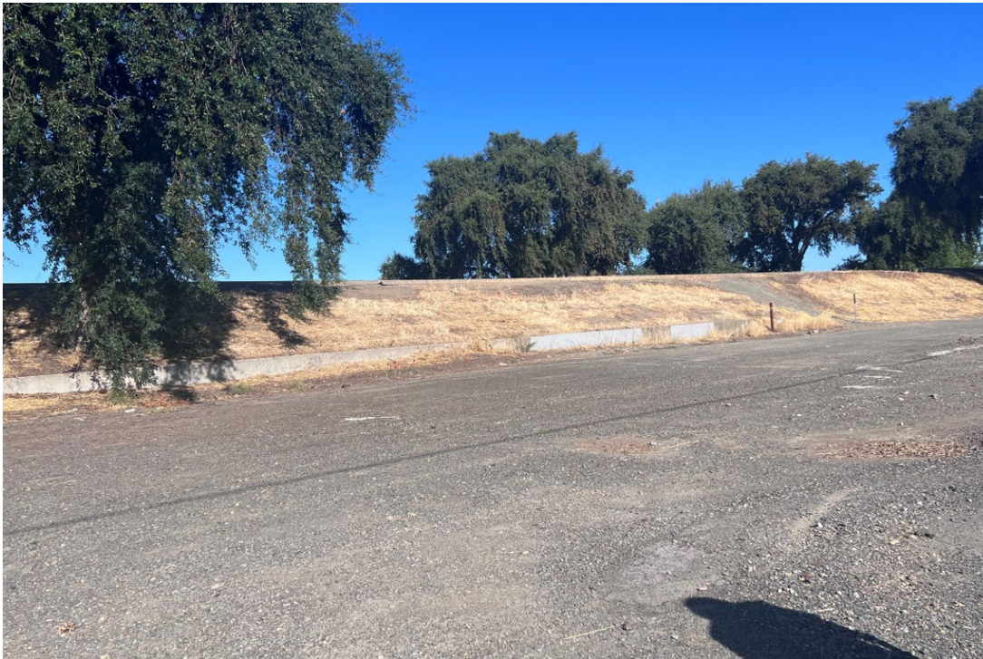
Figure 7.4. Planned location of monument.