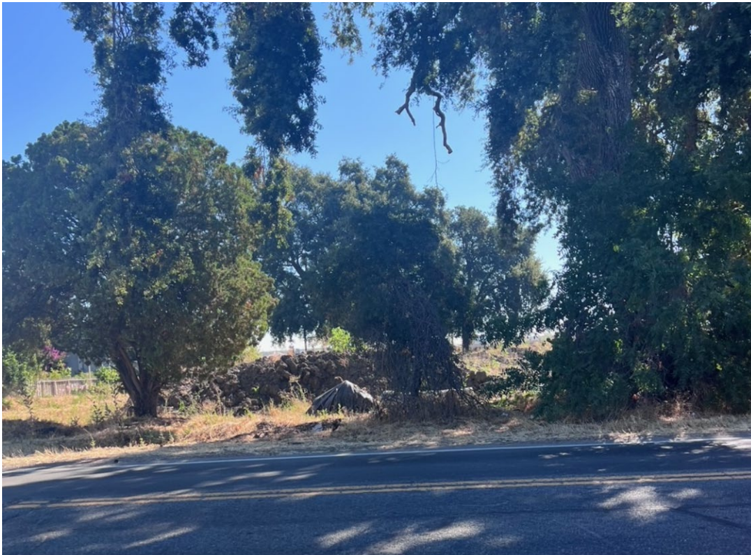
Figure 7.3. Planned location of interpretive sign.

The purpose of this project was to develop a conceptual signage plan, conduct community outreach, prepare 65 percent design plans, and complete environmental clearance for the installation of the gateway monuments (freestanding structures or signs) and one interpretive sign in the unincorporated community of Freeport. Phase two of the project (acquisition) was awarded Proposition 68 funds in October 2024 (Project ID P6822) and consideration of award for Phase three (implementation) is described in Agenda Item 8.1.