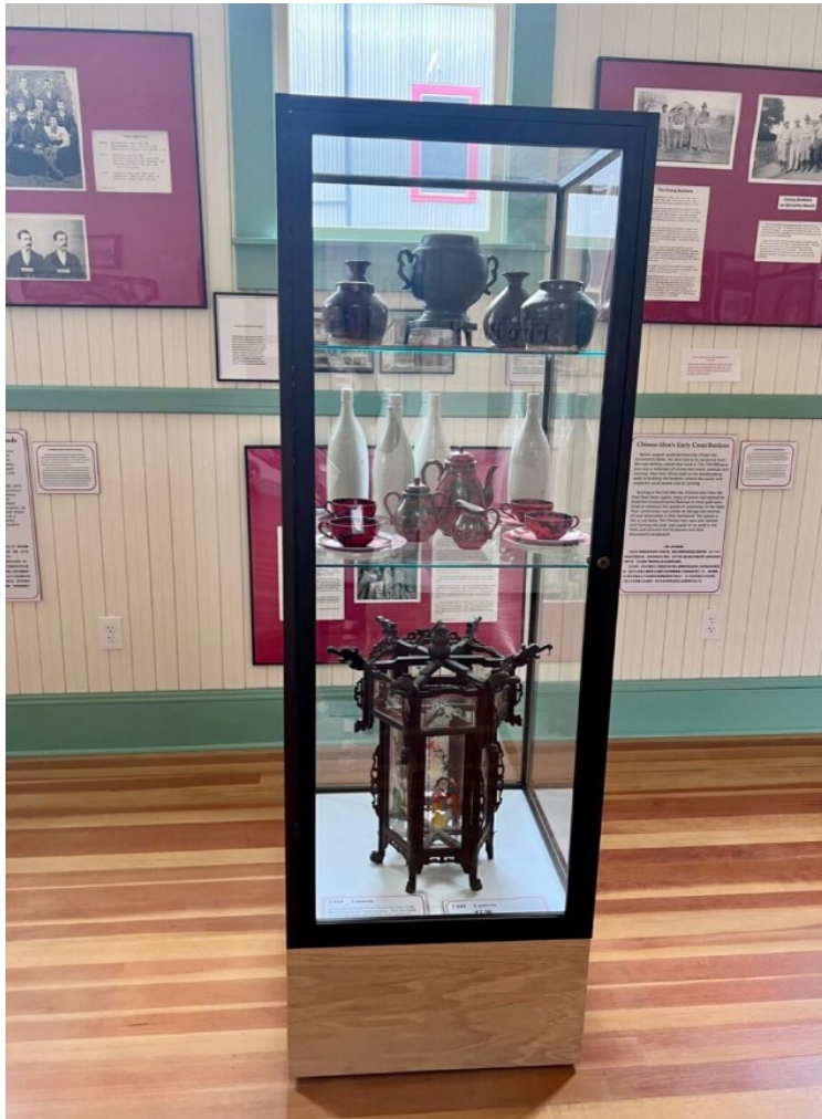
Figure 7.2. Display case in the Isleton Museum.

The purpose of this project was to purchase and use proper display cases for housing historic and cultural items in the Isleton Museum, located in the renovated Bing Kong Tong Building. Items included in the display cases are everyday objects that show what life was like in Isleton from prehistoric times, through to the mid-1900s. Cultural artifacts include Native American baskets, Chinese pottery, household utensils, and agricultural tools used by early immigrants. Display cases are specifically designed to protect artifacts while also providing educational displays for viewing. Phase two of the project (implementation) was awarded Proposition 68 funds in March 2024 (Project ID P6824).