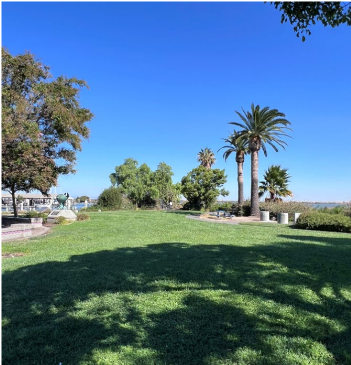
Figure 7.1. Central Harbor Park in Pittsburg, CA.

The purpose of this project was to complete planning documents and public outreach for future enhancements to the Boat Launch Facility and Central Harbor Park. These enhancements include improved paths of travel, new public restrooms, tourist-targeted signs and viewing benches, educational signage, a fish cleaning station, picnic tables, a play structure, and additional security infrastructure. Phase two of the project (implementation) was awarded CAR funding in May 2023 (Project ID CAR06).