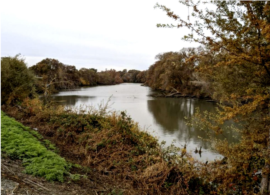
Figure 7.1. Confluence of Elk Slough and Sutter Slough along southern project segment.

The purpose of this project was to identify a detailed fish passage and flood improvement design for Elk Slough that would meet the Recovery Actions identified in the 2014 NOAA Fisheries Salmon Recovery Plan. Water quality monitoring, hydrodynamic modeling, and community outreach were completed to inform project design plans. The Design Report prepared under this grant includes plans for bioengineered levee improvements that would enhance the existing riparian habitat along the slough to improve habitat conditions for listed species in the area. Design plans include the installation of two gates – one upstream and one at the downstream end of Elk Slough. These gates could be opened and closed to improve water quality in Elk Slough and to protect adjacent agricultural lands from flooding. Knowledge gained during the planning phase indicated a need for additional CEQA compliance beyond what was funded by the Delta Conservancy Proposition 1 grant. The project team is exploring funding opportunities to prepare an Environmental Impact Report, secure required permits, and to fund project construction.