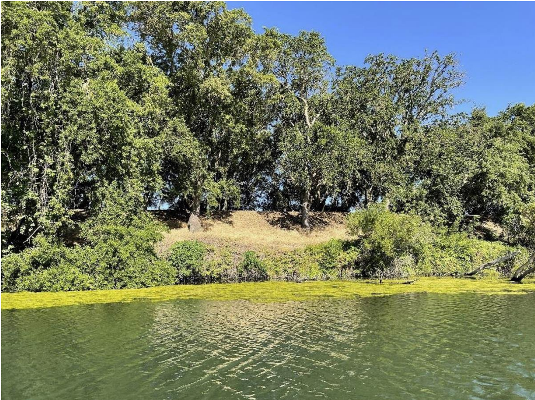
Figure 7.3. A typical vegetated levee along the bank of Elk Slough.