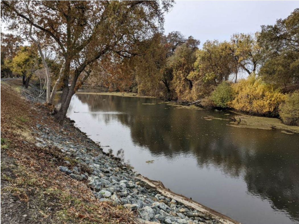
Figure 7.2. Riprap on the left bank of Elk Slough.