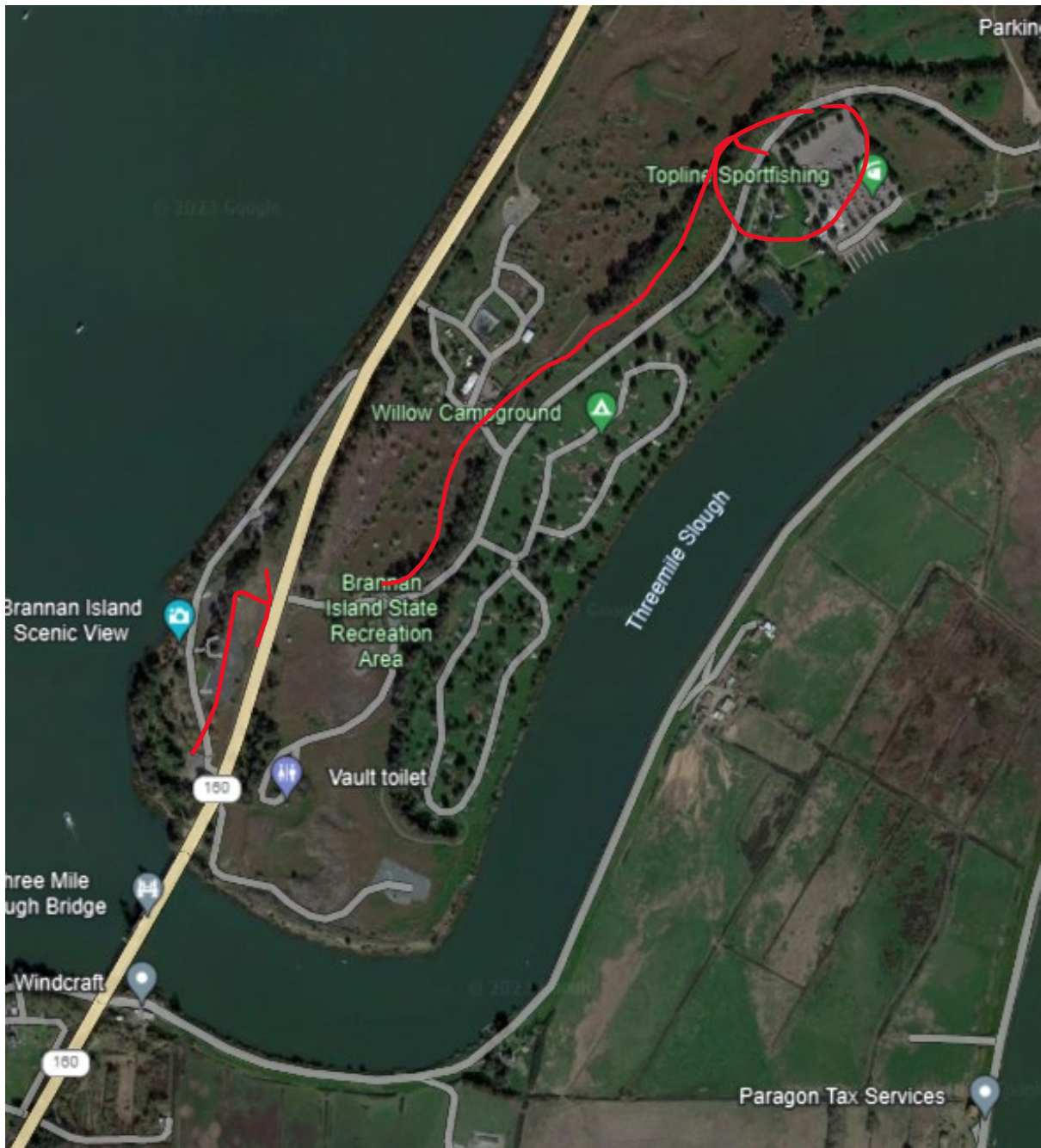
Figure 2. Map from entrance of Brannan Island State Recreation Area to boat launch.