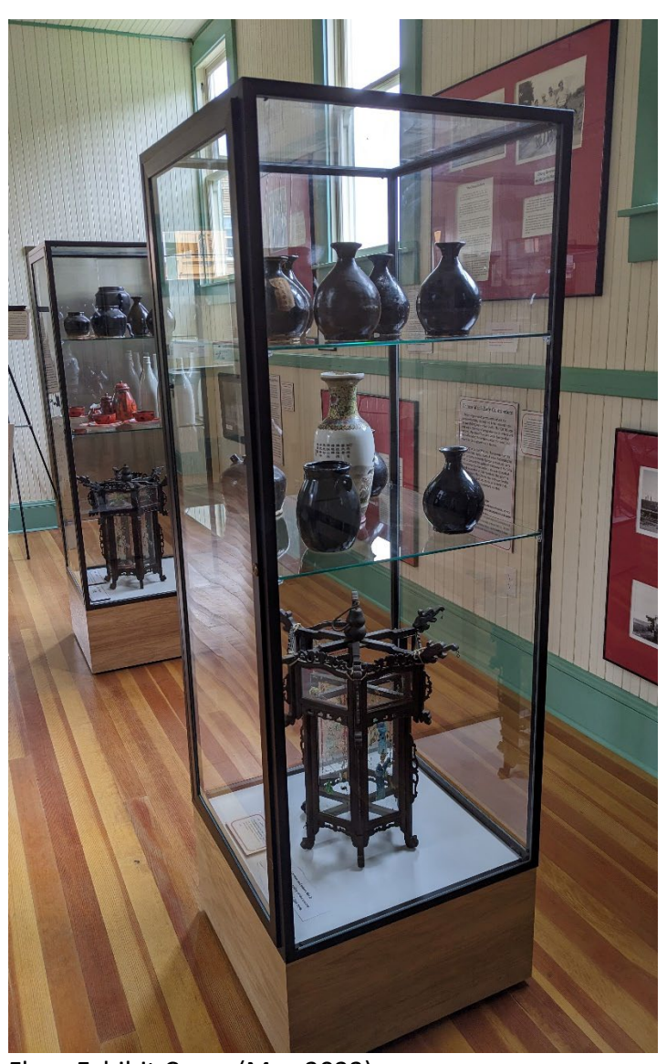
Floor Exhibit Cases (May 2023)

Conservancy staff conducted a site visit to view the installed displays at the Isleton Museum in the Bing Kong Tong Building. These display cases are part of the $44,500 grant to install museum quality display cases to showcase historic artifacts at the Isleton Museum.