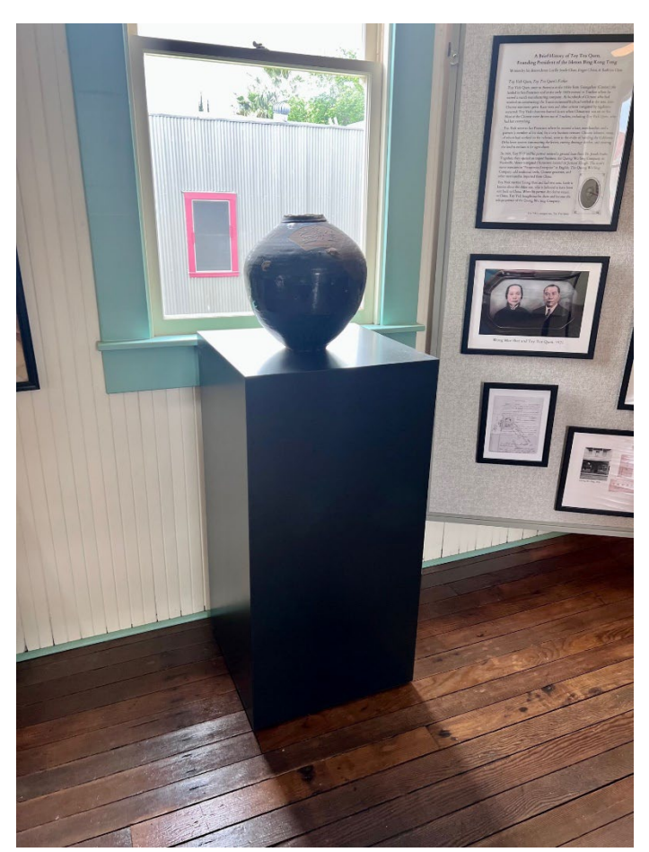
Pedestal Display (May 2023)