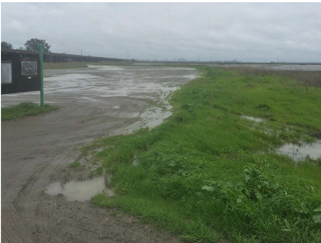
Before: Demonstration area covered with non-native grasses and noxious weeds (Winter 2016)