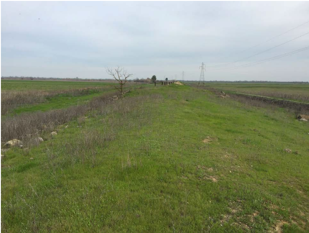
Before: Corridor North on a trestle mound (Winter 2016)

This recently completed project created approximately five miles of new habitat along two corridors, and half an acre of a public-access demonstration planting. The multi-beneficial habitats provide transit corridors for birds, mammals, and other wildlife species to escape advancing flood waters and to provide cover and floral resources outside of the flood season. The project involved the local community through stewardship events that provided hands-on restoration and educational experiences for high school-aged students and members of the public.