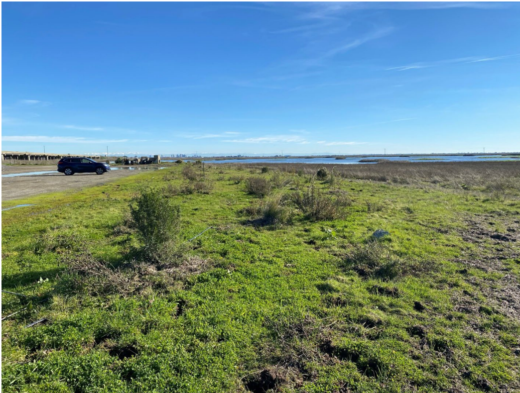
After: Demonstration area with native grasses, wildflowers, and shrubs (Summer 2022)