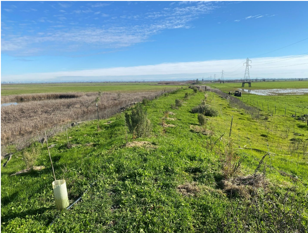
After: Corridor North on the same trestle mound (Winter 2022)