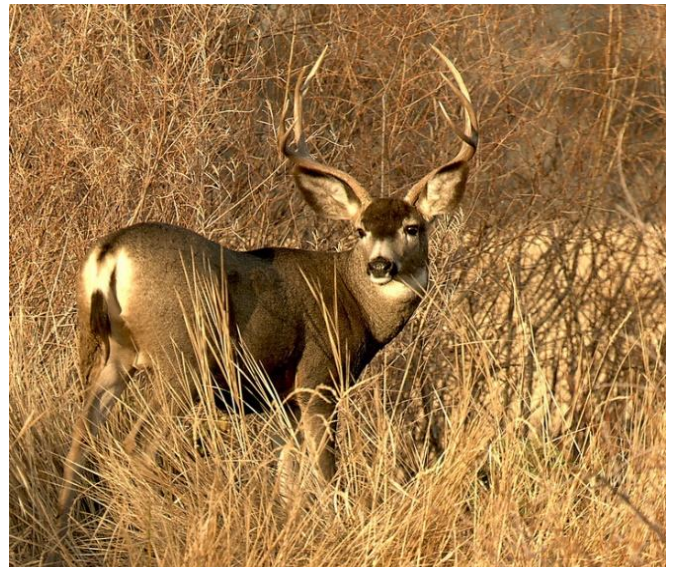
Mule Deer Buck.

For more information about this project, visit ecoatlas.org . For more information about the Conservancy's Proposition 1 Ecosystem Restoration and Water Quality grant program, visit http://deltaconservancy.ca.gov/prop-1/ .