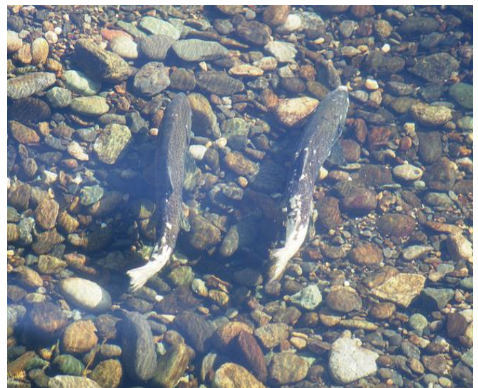
Chinook Salmon.

For more information about this project, visit ecoatlas.org . For more information about the Conservancy's Proposition 1 Ecosystem Restoration and Water Quality grant program, visit http://deltaconservancy.ca.gov/prop-1/ .